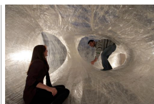
Inside the "Tape Installation"