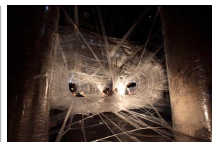
『Tape Vienna』 (2010)