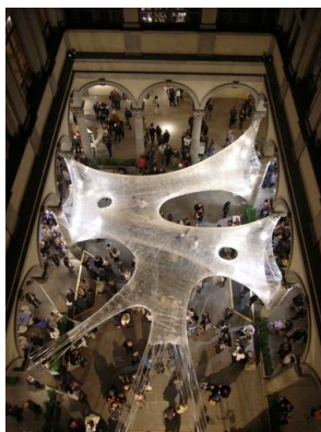
『Tape Florence』 (2011)