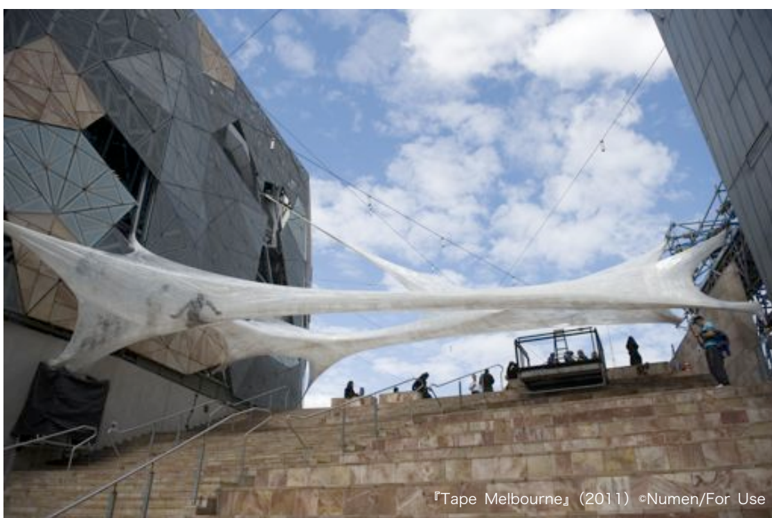
『Tape Melbourne』 (2011) ©Numen/For Use

Numen/For Use's eagerly awaited first solo exhibition in Asia! A giant immersive art installation appears at Spiral this autumn.