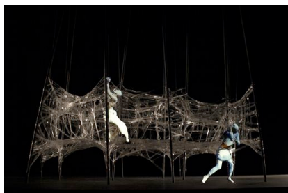
The dance performance "Metamorphoses," performed at the Yugoslav Drama Theatre in Belgrade in 2010. The stage design was later developed into "Tape Installation."