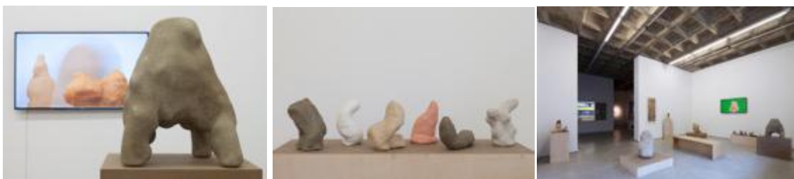
LOOCK Galerie exhibition (Berlin, 2016) Clay, video