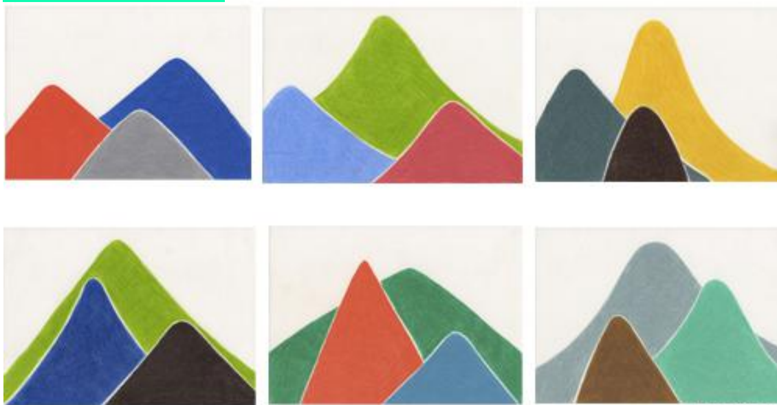
"mountains" Paper, colored pencil