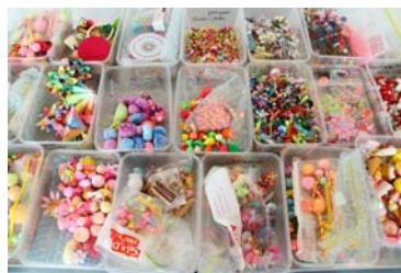
PIP & POP Open Studio Work at Spiral Garden Esplanade